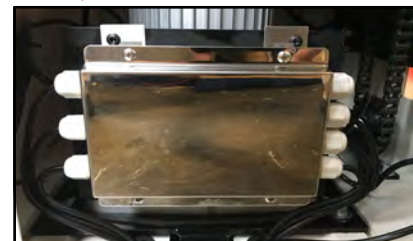
Electrical Junction Box