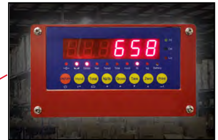
LED Digital Display