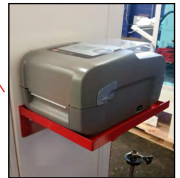
Optional Printer Package