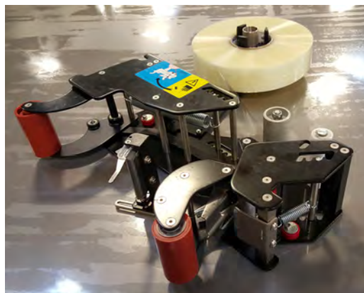
Tape Head Assembly