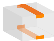
Center Seam Top and Bottom