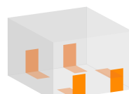
Leading and Trailing Dual Head Bottom L-Clips