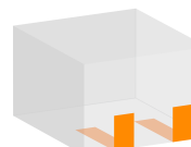
Leading Dual Head Bottom L-Clips