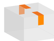
Leading and Trailing Top L-Clips