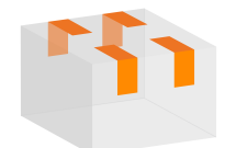
Leading and Trailing Dual Head Top L-Clips