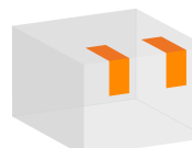
Leading Dual Head Top L-Clips