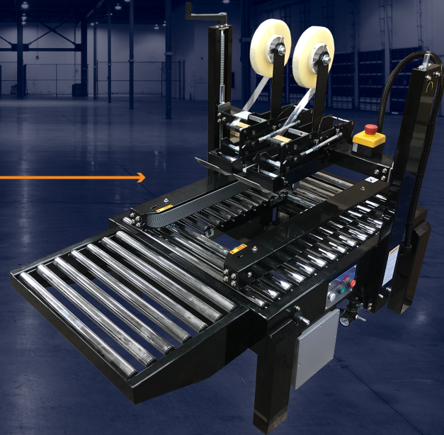
Pictured: Dual Head Top Inline L-Clip Machine

The Inline L-Clip is available in three sizes to cover a wide range of box widths!